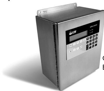
Optional Stainless Steel Enclosure