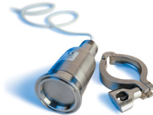
SC43SS Stainless Steel Sensor