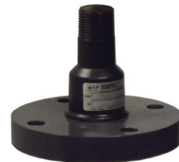
SC43TF Teflon® Sensor