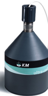
UC24PP PVC Sensor