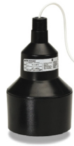
SC14PT PVC Sensor